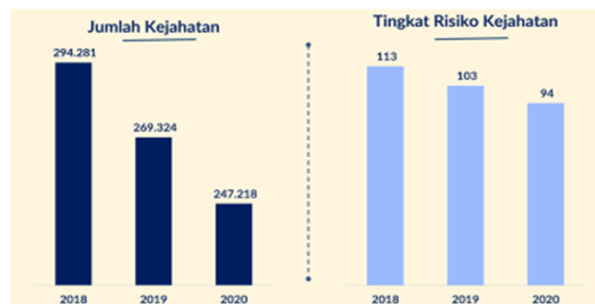
Image 1. Crime rate and Crime clock, 2018-2020

There are several indicators that are commonly used to measure crime from a macro perspective and the level of seriousness. In the macro context, there are indicators of the number of crimes, the crime rate per 100,000 population (crime rate), and the time interval for the occurrence of a crime (crime clock).