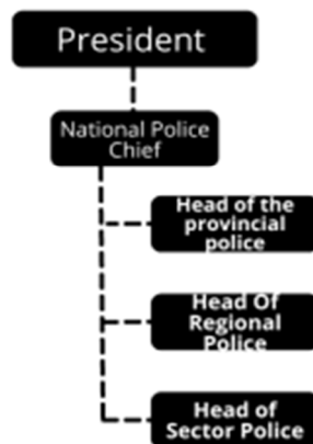
Image 3. Structure of Indonesia Police bureaucracy

Source: Presidential Regulation of the Republic of Indonesia No. 52 of 2010.